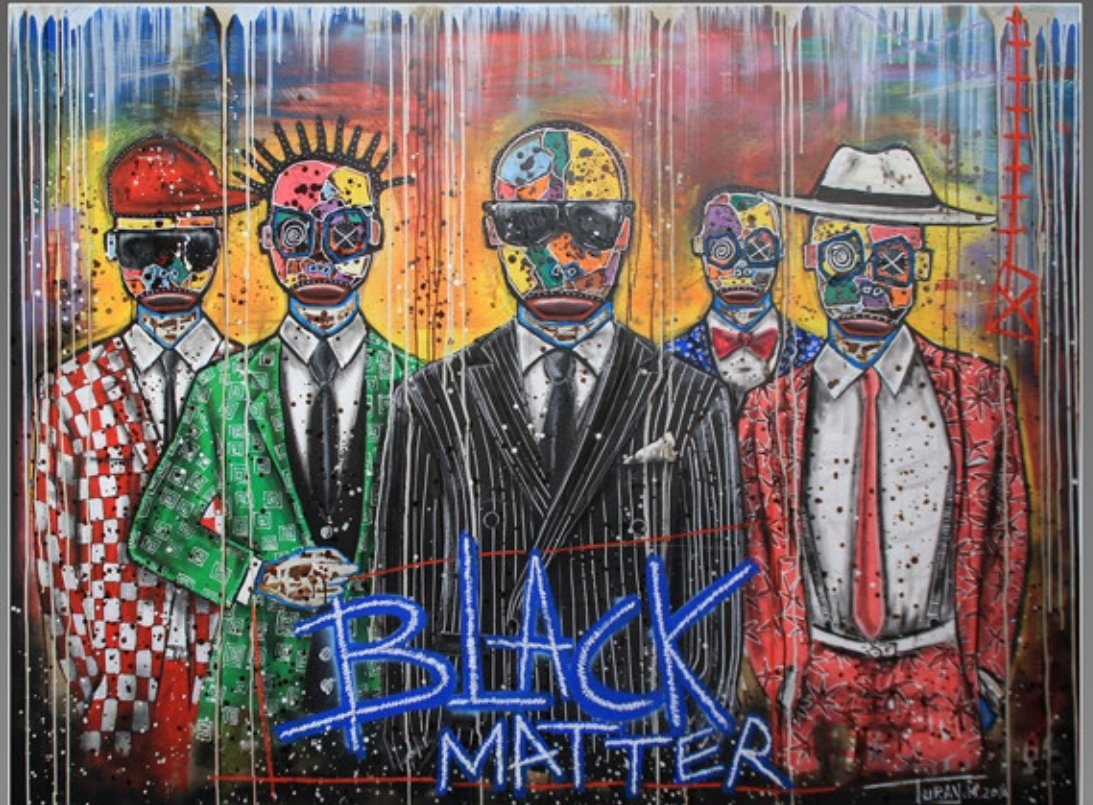
Black matter - 200 x 150 cm