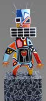
Romantic man - H. 130 cm