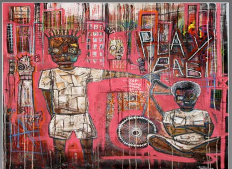
Play Babi - 150 x 200 cm