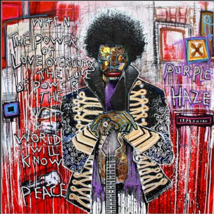
Jimmy Hendrix - 150 x 150 cm