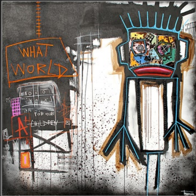
Grey future - 200 x 200 cm