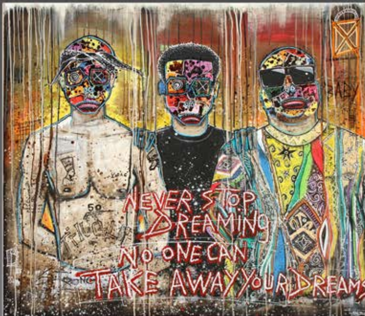
Message to the youth - 130 x 150 cm