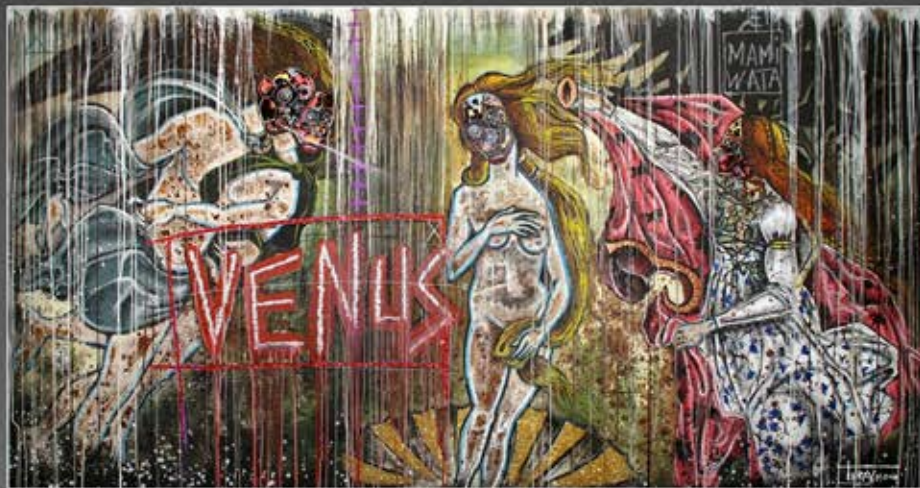
Venus - 250 x 130 cm