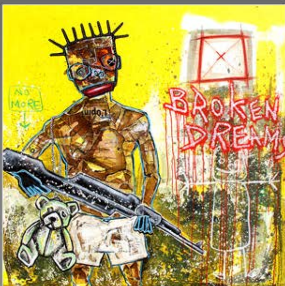
Broken dreams - 150 x 150 cm