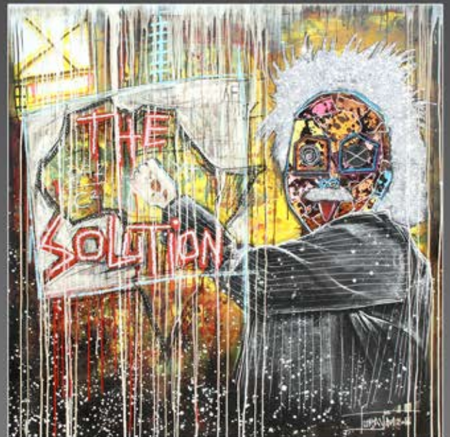
The solution - 150 x 150 cm