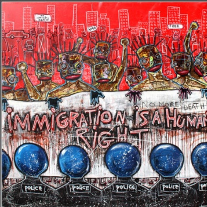
No more death on the pursuit of a better life - 200 x 200 cm