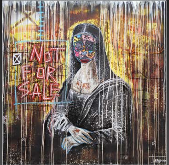
Mona from Africa - 150 x 150 cm