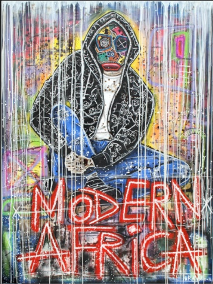
Modern Africa - 150 x 200 cm