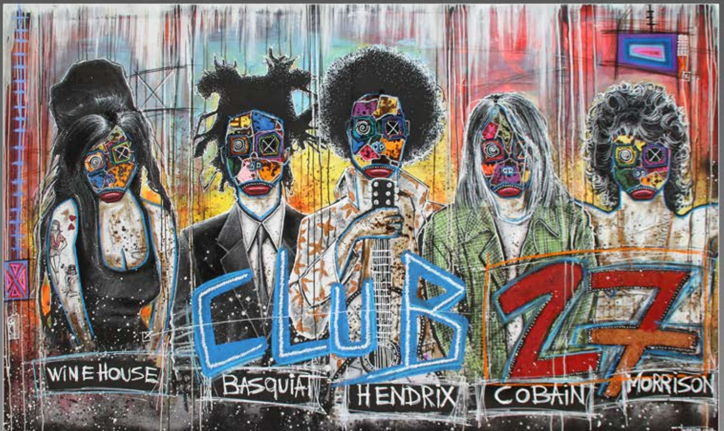
Club 27 - 250 x 150 cm