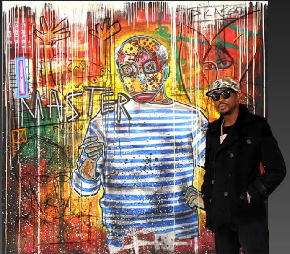
Pablo Picasso tribute - 200 x 200 cm