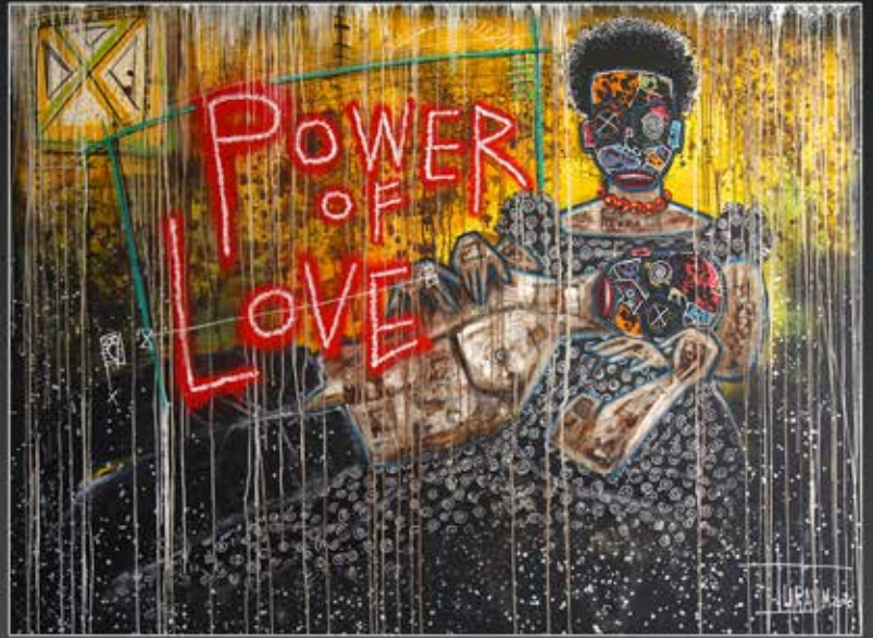
Power of Love - 150 x 200 cm