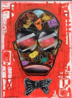
African swagg II - 150 x 200 cm