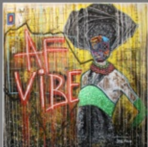
AF VIBE - 200 x 200 cm