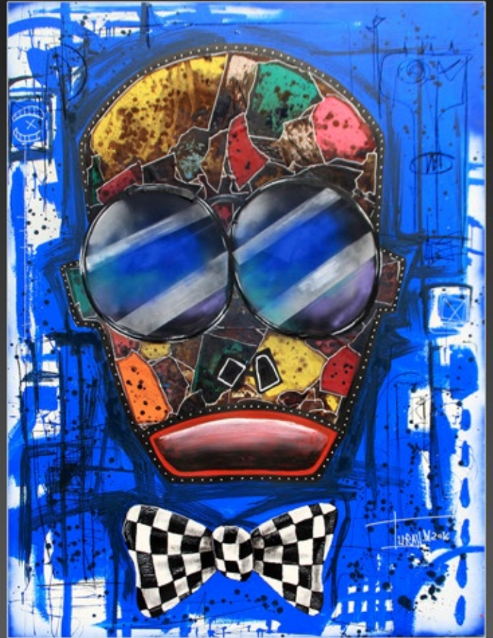
African swagg I - 150 x 200 cm