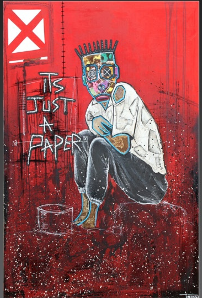
Rich in your heart - 100 x 150 cm