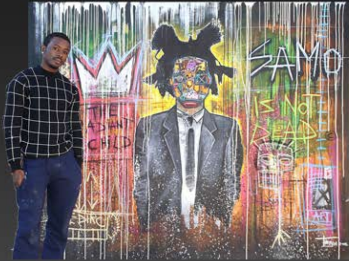
Basquiat tribute - 200 x 150 cm