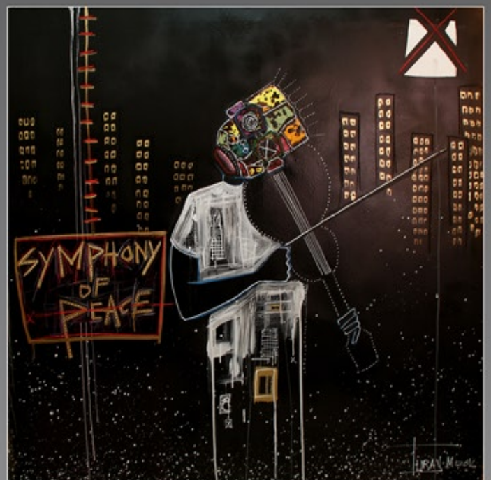
Symphony of peace, night's melody - 150 x 150 cm